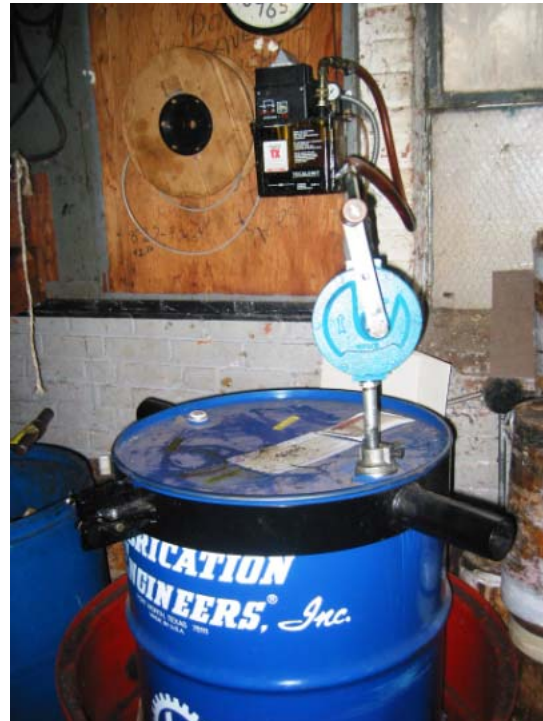
Interlube TX filled with LE 4946

Mr. Tropeano also expressed concern for the Beloit Jones Pulper gearbox. Mr. Tropeano was worried about a foaming issue with the product being used, Shell Omala 220, and higher than usual amperage readings. A sample of the Shell product was obtained and it appeared that the product had exhibited some shearing resulting in a lower viscosity than that recommended by the manufacturer of the pulper. The viscosity of the Omala 220 was 185 cSt @ 40°C, far below the ISO 220 range.