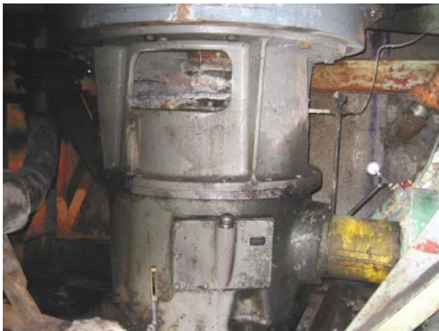
Beloit Jones Pulper